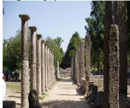
Image of Meteora/Kalambaka