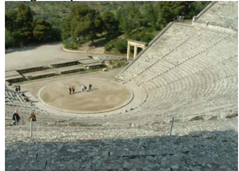
Image of Nafplion