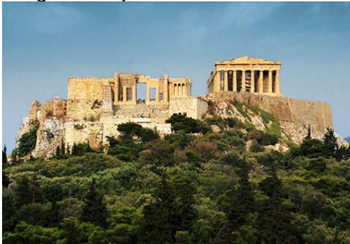
Image of Delphi