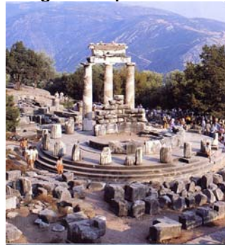
Image of Epidavros